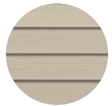
EVERPLANK LUXURY VINYL SIDING