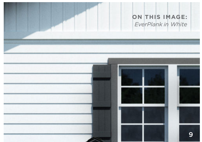
ON THIS IMAGE: EverPlank in White

Without the need for repainting, luxury vinyl siding saves an average of $1,500 PER YEAR.