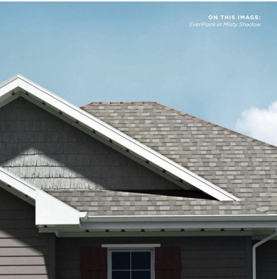
ON THIS IMAGE: EverPlank in Misty Shadow